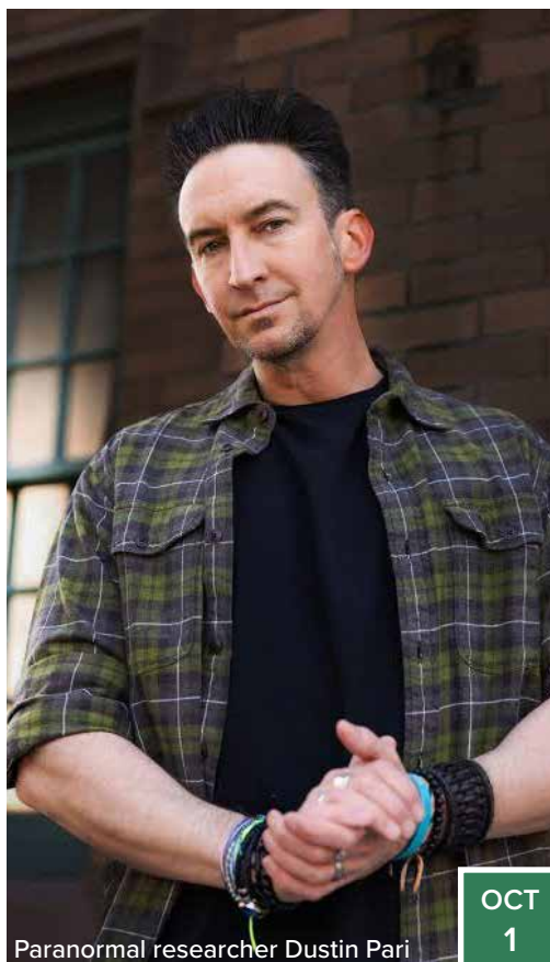
Paranormal researcher Dustin Pari

Please submit your response online by October 31. To learn more about the Framingham Library Long-Range Plan, visit framinghamlibrary.org/about/lrp .