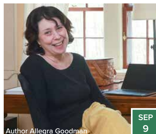
Author Allegra Goodman