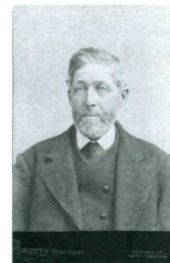
Eliphalet Eames, circa 1890