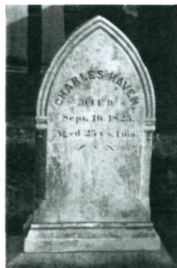
Charles Haven, Old South Cemetery

Cemeteries play a significant role in genealogical research. Gravestones are an immediate and generally reliable source of information about our ancestors. Not only can a headstone tell you who is buried in a plot, it can contain the dates of birth and death for those interred there.