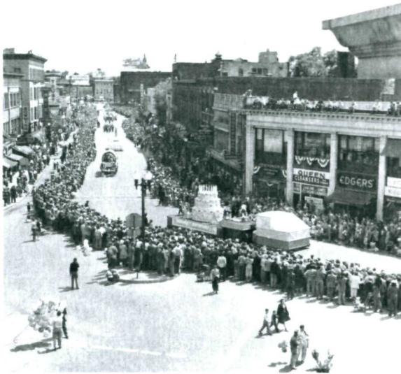
250th anniversary parade

An indexed collection of photographs depicting Framingham in the nineteenth and twentieth centuries