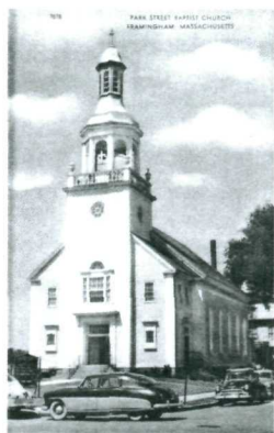
Park Street Baptist Church

The early history of Framingham is inextricably linked to the history of the churches in town. The original meetinghouse and clergymen were government funded. Later schisms in the established churches were often related to civic disputes. The collection includes catalogued information on First Parish Church, Park Street Baptist Church, and Plymouth Church. Information on other churches can be found in the vertical file.