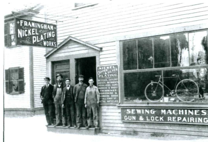
Framingham Nickel Plating Works, circa 1900

The vertical file includes information on major businesses located in Framingham. Directories provide the location of businesses and may include advertisements for these companies. The Dennison Collection has information on the Dennison Manufacturing Company, for many years one of Framingham's largest employers. The Round Robin , an illustrated company newsletter issued monthly in the 1910s and 1920s, featured stories on new developments and staff news. Instructional pamphlets using Dennison products also are available.