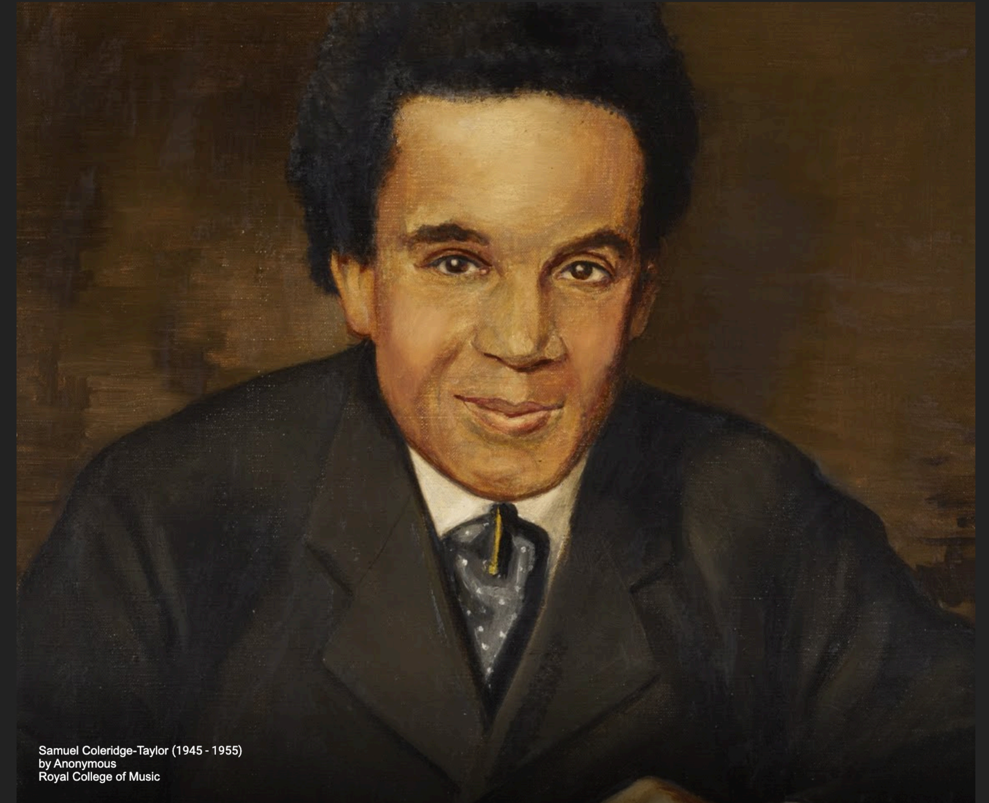
Samuel Coleridge-Taylor (1875 - 1912)