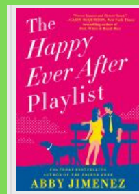
The Happy Ever After Playlist By Abby Jimenez

When her partner of over a decade suddenly ends things, Laurie is left reeling. Her once perfect life is in shambles and the thought of dating again in the age of Tinder is nothing short of horrifying.