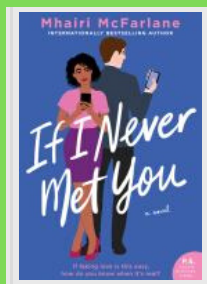
If I Never Met You Mhairi McFarlane

As the only female firefighter in her Texas firehouse, Cassie Hanswell is excellent at dealing with other people's tragedies. But she never anticipated that her estranged and ailing mother would ask her to move to Boston.