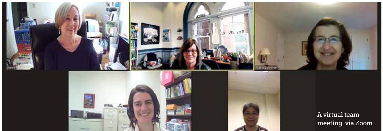
A virtual team meeting via Zoom